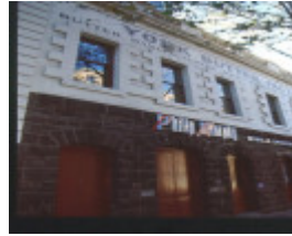
1 former york butter factory h396 facade 2 may2000