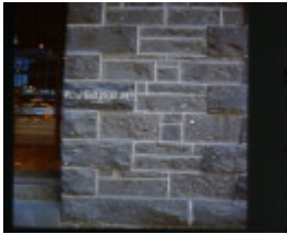
former york butter factory h396 bluestone exterior may2000