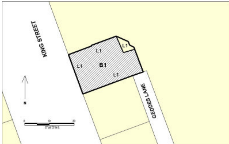
former york butter factory h396 extent may2000