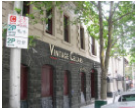
FORMER YORK BUTTER FACTORY SOHE 2008