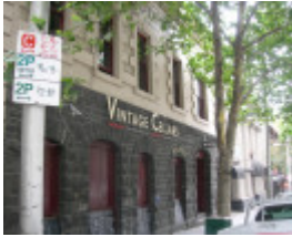
FORMER YORK BUTTER FACTORY SOHE 2008