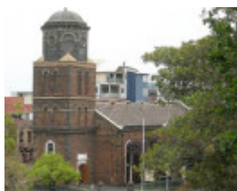
ST JAMES OLD CATHEDRAL SOHE 2008