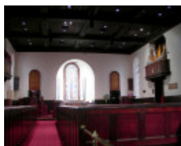
ST JAMES OLD CATHEDRAL SOHE 2008