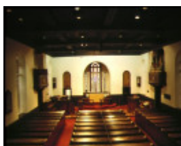
st james old cathedral king street melb interior