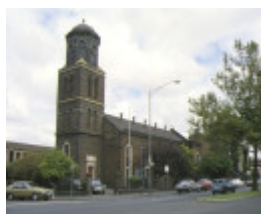
1 st james old cathedral king street melb external view