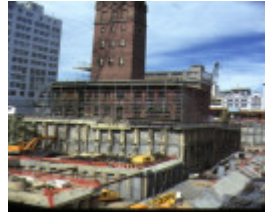
1 coops shot tower & flanking building knox place melb external view construction of melb central