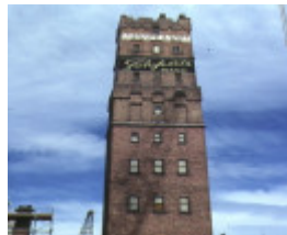
coops shot tower & flanking building knox place melbourne tower detail prior to erection of melbourne central