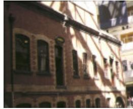
coops shot tower & flanking building knox place melb front view