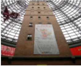
COOPS SHOT TOWER AND FLANKING BUILDING SOHE 2008