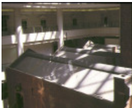
coops shot tower & flanking building knox place melb roof detail