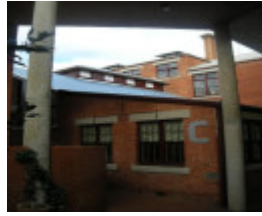
Building C, Old Chemistry Building.jpg