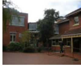
Building B, W J Gribble Building, former School of Technical Art.jpg