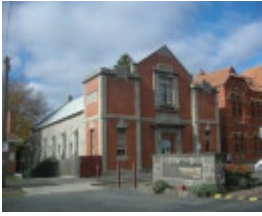
Building P, Former Wesleyan Chapel, later School of Mines Museum..jpg