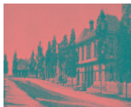
1882_Supreme Court Bldg.jpg