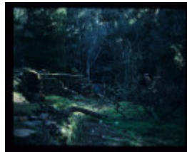
WELSH VILLAGE 30