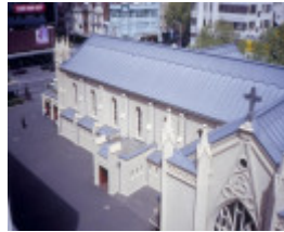
h00013 st francis catholic church lonsdale st melbourne roof she project 2003