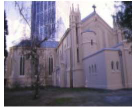
st francis catholic church melb west side view