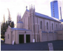
1 st francis catholic church melb east side view