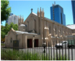
ST FRANCIS CATHOLIC CHURCH SOHE 2008