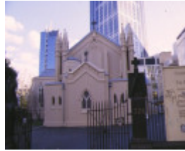
st francis catholic church melb front view