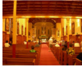
ST FRANCIS CATHOLIC CHURCH SOHE 2008