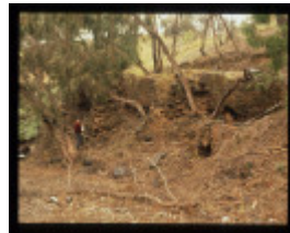
GRAND JUNCTION MINE