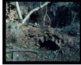
GRAND JUNCTION MINE