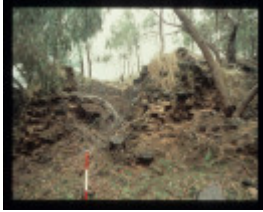
GRAND JUNCTION MINE