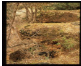
GRAND JUNCTION MINE