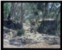
GRAND JUNCTION MINE