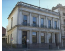
H00109 photo former union bank lydiard st ballarat