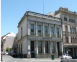
FORMER UNION BANK BUILDING SOHE 2008