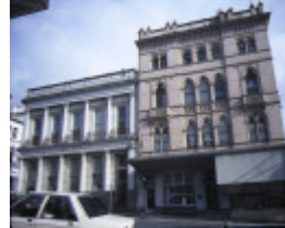
Former Union Bank Building Ballarat Front View