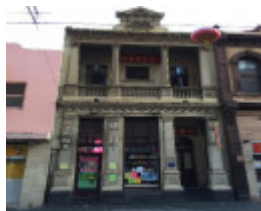
NUM PON SOON SOCIETY BUILDING July 2016