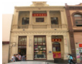
NUM PON SOON SOCIETY BUILDING SOHE 2008