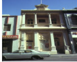
1 num pon soon little bourke street melbourne front view