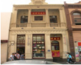
NUM PON SOON SOCIETY BUILDING SOHE 2008