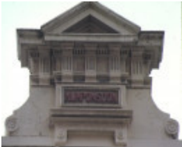
num pon soon little bourke street melbourne detail parapet