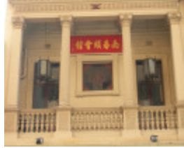
NUM PON SOON SOCIETY BUILDING SOHE 2008