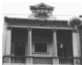
NUM PON SOON SOCIETY BUILDING July 2016