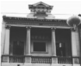
NUM PON SOON SOCIETY BUILDING July 2016