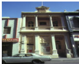
1 num pon soon little bourke street melbourne front view