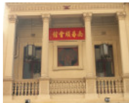
NUM PON SOON SOCIETY BUILDING SOHE 2008