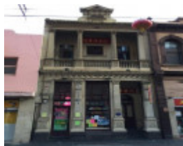
NUM PON SOON SOCIETY BUILDING July 2016