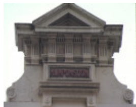
num pon soon little bourke street melbourne detail parapet