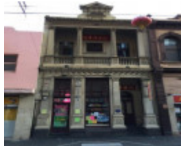
NUM PON SOON SOCIETY BUILDING July 2016