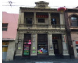
NUM PON SOON SOCIETY BUILDING July 2016