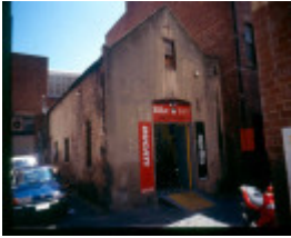
h00826 heape court front