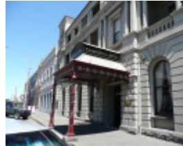
CRAIG'S ROYAL HOTEL SOHE 2008