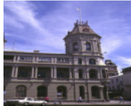
1 craig's royal hotel ballarat front view