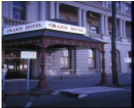
craig's royal hotel ballarat verandah entrance