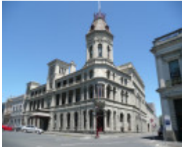
CRAIG'S ROYAL HOTEL SOHE 2008