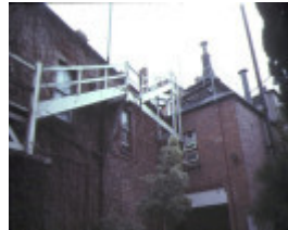
craig's royal hotel ballarat rear view