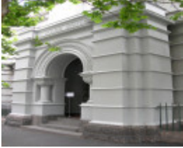
CITY WATCH HOUSE SOHE 2008