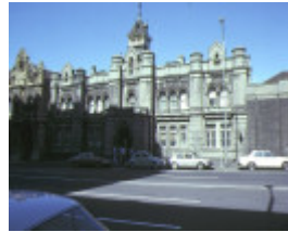
city watch house russell street melbourne front view jan1979