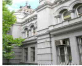
CITY WATCH HOUSE SOHE 2008