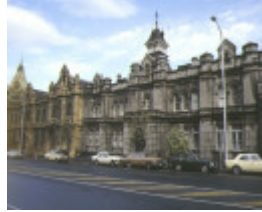
1 city watch house russell street melbourne front view 1993