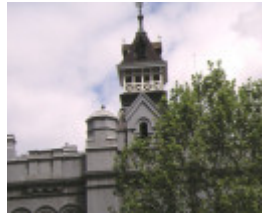
city watch house russell street melbourne tower detail 1993