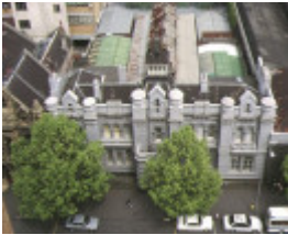
city watch house russell street melbourne aerial view oct1993