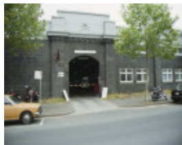
1 police garage russell street melbourne front view of entrance