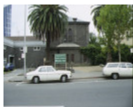
police garage russell street melbourne view of side of building