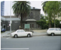
police garage russell street melbourne view of side of building