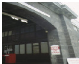
police garage russell street melbourne detail of entrance