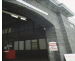
police garage russell street melbourne detail of entrance