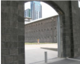
POLICE GARAGE SOHE 2008