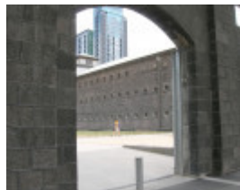
POLICE GARAGE SOHE 2008