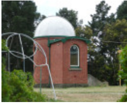
BALLARAT MUNICIPAL OBSERVATORY SOHE 2008