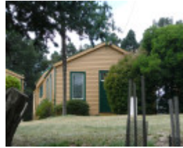
BALLARAT MUNICIPAL OBSERVATORY SOHE 2008