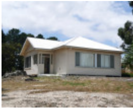
BALLARAT MUNICIPAL OBSERVATORY SOHE 2008