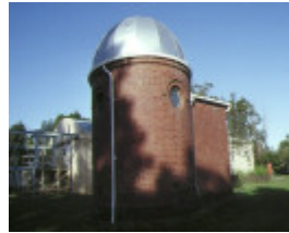
ballarat municipal observatory front view