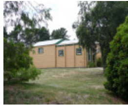
BALLARAT MUNICIPAL OBSERVATORY SOHE 2008