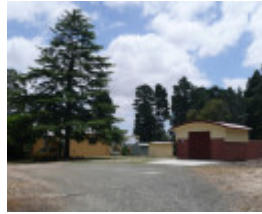
BALLARAT MUNICIPAL OBSERVATORY SOHE 2008