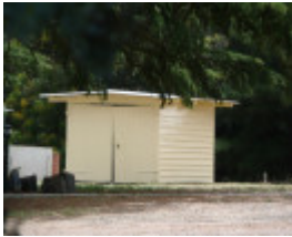
BALLARAT MUNICIPAL OBSERVATORY SOHE 2008