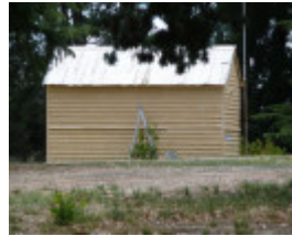
BALLARAT MUNICIPAL OBSERVATORY SOHE 2008