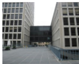
State Government Offices Treasury Precinct, April 2012.JPG