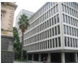
State Government Offices Treasury Precinct, April 2012.JPG