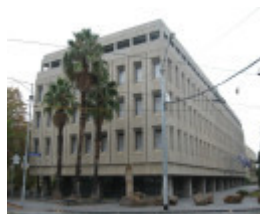
Former State Chemical Laboratoires Treasury Precinct, April 2012.JPG