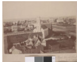
Bowling Green site: St Peters and Manse