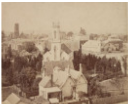
Bowling Green site: St Peters and manse