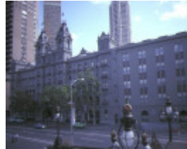
1 hotel windsor spring street melbourne front view