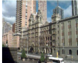
hotel windsor spring street melbourne front elevation