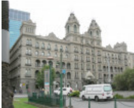
HOTEL WINDSOR SOHE 2008