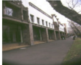
former kellow falkiner showrooms st kilda road melbourne street view