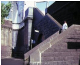
princes walk vaults batman avenue melbourne stairway feb1985