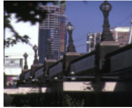
princes walk vaults batman avenue melbourne cast iron lights feb1985