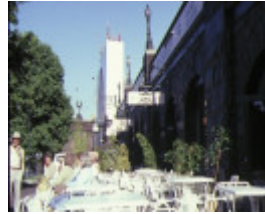
1 princes walk vaults batman avenue melbourne cafes on walk feb1985