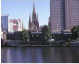
princes walk vaults batman avenue melbourne view from across yarra feb1985