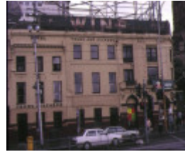
young & jackson's princes bridge hotel swanston street melbourne view from flinders street