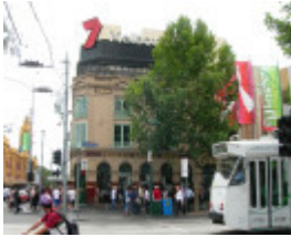
YOUNG AND JACKSON'S PRINCES BRIDGE HOTEL SOHE 2008