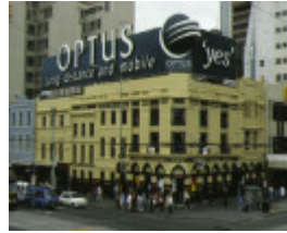
1 young & jackson's princes bridge hotel swanston street melbourne corner view