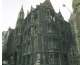
st pauls cathedral melb chapter hall