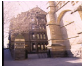
st pauls cathedral melb external offices