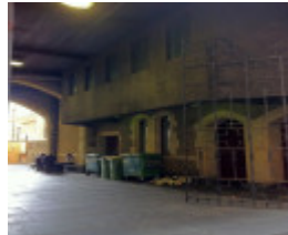
Before Photographs - Reference F3931 2014