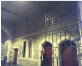
After Photographs - Reference F3931 2016