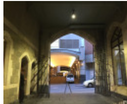
After Photographs - Reference F3931 2016