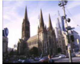
1 st pauls cathedral melb external view