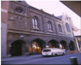
st pauls cathedral melb external chapter house