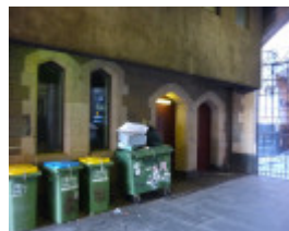
Before Photographs - Reference F3931 2014