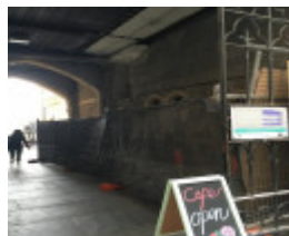
During Photographs - Reference F3931 2015