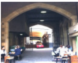
Before Photographs - Reference F3931 2014