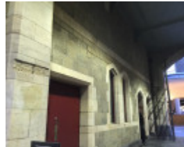
After Photographs - Reference F3931 2016