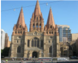
ST PAULS CATHEDRAL PRECINCT SOHE 2008