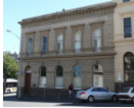
ANZ BANK SOHE 2008