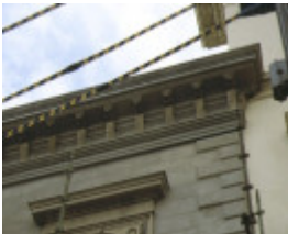
anz bank ballarat roof detail