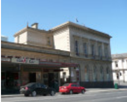
ANZ BANK SOHE 2008