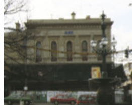
1 anz bank ballarat front view