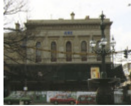
1 anz bank ballarat front view