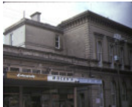
anz bank ballarat side view