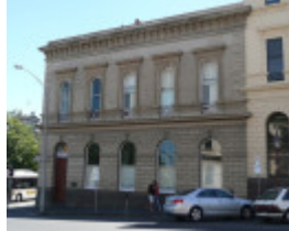
ANZ BANK SOHE 2008