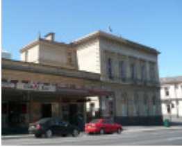
ANZ BANK SOHE 2008