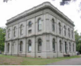
ROYAL SOCIETY OF VICTORIA SOHE 2008