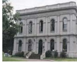
h00373 royal society view 2003