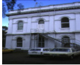
Royal Society Of Victoria Victoria Street Melbourne Rear View Oct 1986