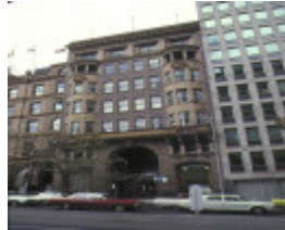
queensland building william street melbourne front view may1978