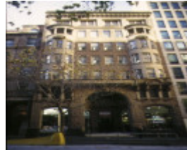
1 queensland house william street melbourne front elevation jun1997