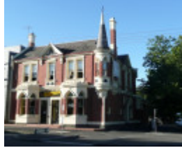
FORMER RESIDENCE SOHE 2008