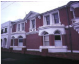
residence sturt street ballarat side view