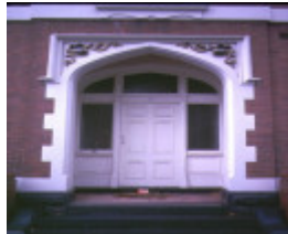
residence sturt street ballarat front entrance