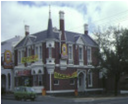
1 residence sturt street ballarat front view mar1983