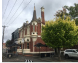
Corner Sturt Street Errard Street