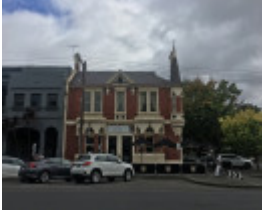
View from Sturt Street