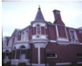
residence sturt street ballarat detail of turret