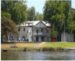
MELBOURNE UNIVERSITY BOAT CLUB SHED SOHE 2008