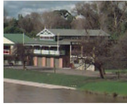
melbourne university boat club front elevation