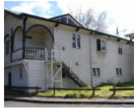
h00682 melbourne university boat club shed yarra bank off jeffries pde melbourne side