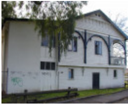
h00682 melbourne university boat club shed yarra bank off jeffries pde melbourne other side she project 2004