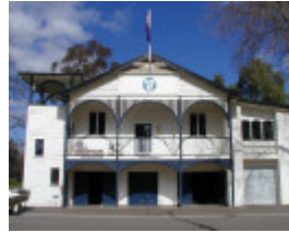
h00682 1 melbourne university boat club shed yarra bank off jeffries pde melbourne front