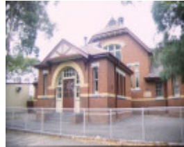
1 primary school no 2815 richardson street middle park infant school front view feb1998