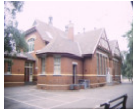
primary school no 2815 richardson street middle park infant school side view feb 1998