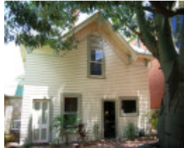
RIO VISTA SOHE 2008