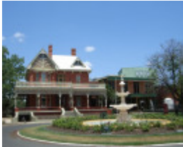
RIO VISTA SOHE 2008