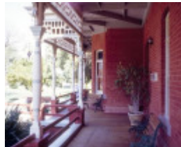
h00729 rio vista currton avenue mildura verandah she project 2003