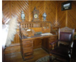
RIO VISTA SOHE 2008