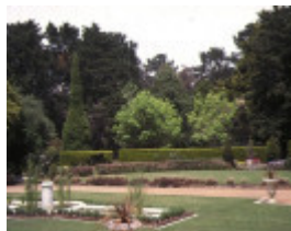
beleura kalimna drive mornington view of garden nov 1977