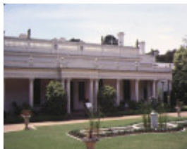
1 beleura kalimna drive mornington front view