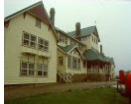
1 mount buffalo chalet front view oct00