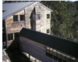
mount buffalo chalet outbuilding