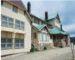
MOUNT BUFFALO CHALET SOHE 2008