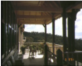
mount buffalo chalet verandah view