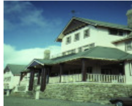
mount buffalo chalet front view