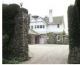
1 marathon marathon drive mt eliza driveway & entrance