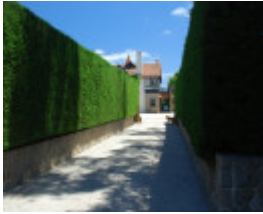
MARATHON SOHE 2008