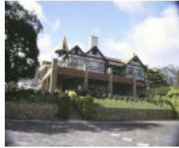
marathon marathon drive mt eliza repainted rear view