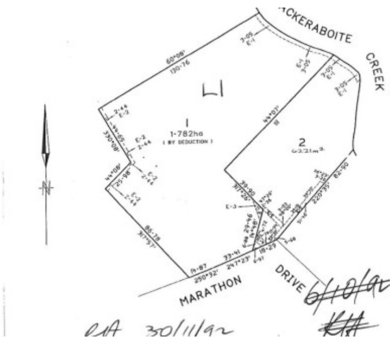
H0946 marathon plan a