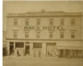
Macs Hotel - c. 1861