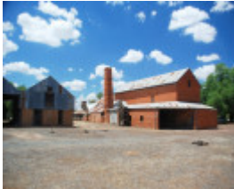
DAY'S FLOUR MILL COMPLEX SOHE 2008