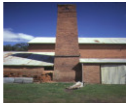
day's four mill complex murchison chimney nov1984