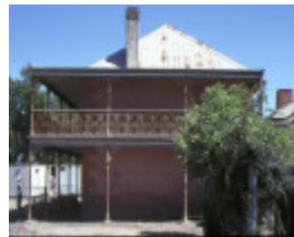
day's flour mill complex murchison side view of homestead