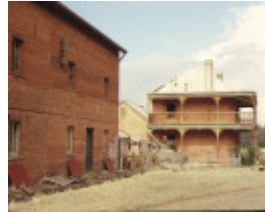
1 day's flour mill complex murchison mill & homestead