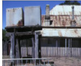
day's flour mill complex murchison corrugated iron building