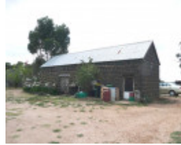
CAMERON HILL SOHE 2008