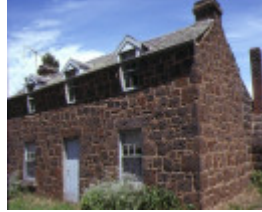
1 cameron hill bannockburn front view