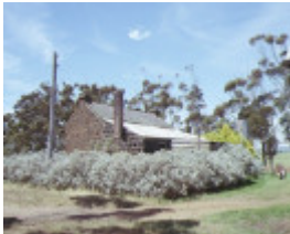
cameron hill bannockburn side view