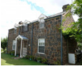
CAMERON HILL SOHE 2008