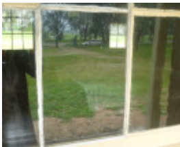
Before Photograph - Reference F3875 2014