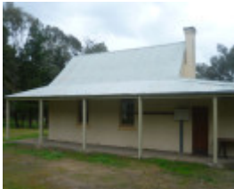
Before Photograph - Reference F3875 2014