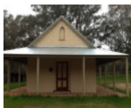
After Photograph - Reference F3875 2016