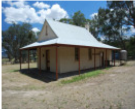
OLD SCHOOL SOHE 2008