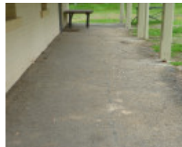
Before Photograph - Reference F3875 2014