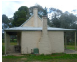
Before Photograph - Reference F3875 2014