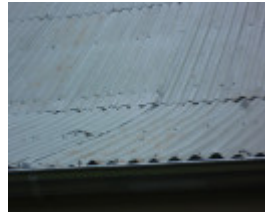
Before Photograph - Reference F3875 2014