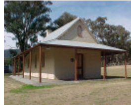
1 old school murrumgee nov99