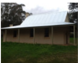
After Photograph - Reference F3875 2016