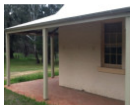
After Photograph - Reference F3875 2016