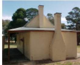
old school murrumgee rear nov99