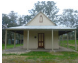
Before Photograph - Reference F3875 2014