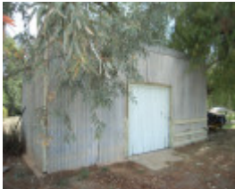
MURRAYVILLE RAILWAY STATION SOHE 2008