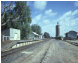
murrayville railway station mckenzie street murrayville property view aug1984