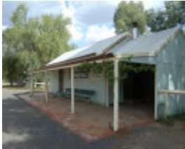
MURRAYVILLE RAILWAY STATION SOHE 2008