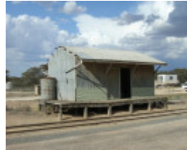
MURRAYVILLE RAILWAY STATION SOHE 2008