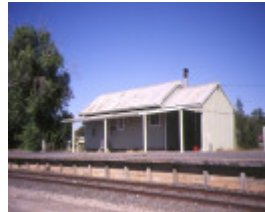
1 murrayville railway station mckenzie street murrayville platform view apr1995