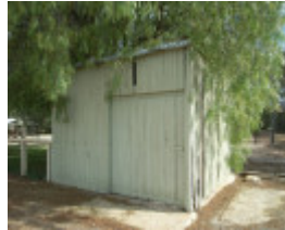
MURRAYVILLE RAILWAY STATION SOHE 2008