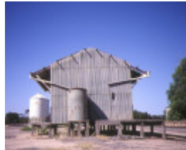
murrayville railway station mckenzie street murrayville goods shed side view apr1995