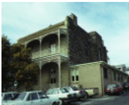
armytage house pakington street newtown rear view