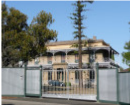
ARMYTAGE HOUSE SOHE 2008