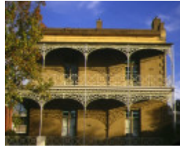
armytage house pakington street newtown side view 1997