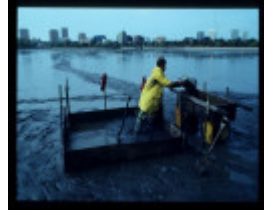
ALBERT PARK LAKE EXCAVATION