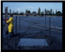
ALBERT PARK LAKE EXCAVATION