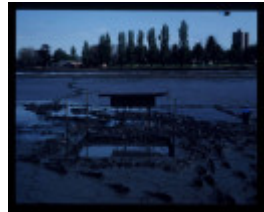
ALBERT PARK LAKE EXCAVATION