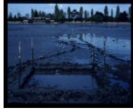
ALBERT PARK LAKE EXCAVATION