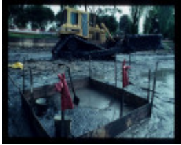
ALBERT PARK LAKE EXCAVATION