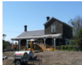
BANNOCKBURN RAILWAY STATION SOHE 2008