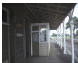
bannockburn railway station platform view aug1984