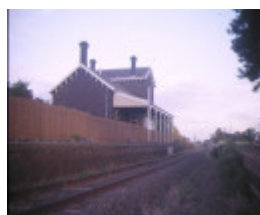
bannockburn railway station side view apr1995