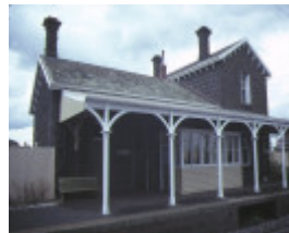
1 bannockburn railway station rear elevation aug1984