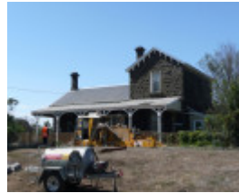
BANNOCKBURN RAILWAY STATION SOHE 2008