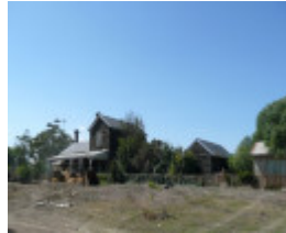
BANNOCKBURN RAILWAY STATION SOHE 2008