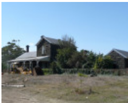
BANNOCKBURN RAILWAY STATION SOHE 2008