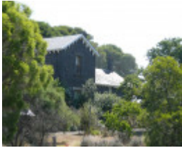
BANNOCKBURN RAILWAY STATION SOHE 2008