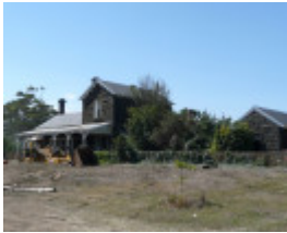
BANNOCKBURN RAILWAY STATION SOHE 2008