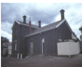
bannockburn railway station front elevation front elevation aug1984