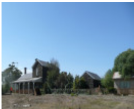
BANNOCKBURN RAILWAY STATION SOHE 2008