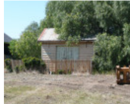
BANNOCKBURN RAILWAY STATION SOHE 2008