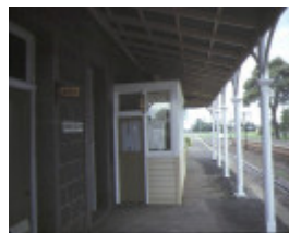
bannockburn railway station platform view aug1984