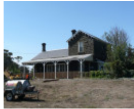
BANNOCKBURN RAILWAY STATION SOHE 2008