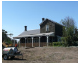
BANNOCKBURN RAILWAY STATION SOHE 2008