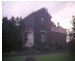
bannockburn railway station front elevation apr1995