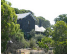
BANNOCKBURN RAILWAY STATION SOHE 2008