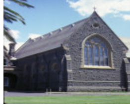
sacred heart convent & college retreat rd newtown chapel front