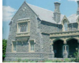
sacred heart convent & college reatreat road newtown front elevation publication