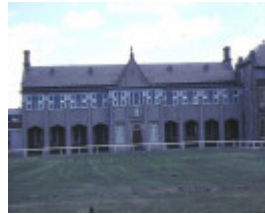
sacred heart convent & college retreat rd newtown rear building