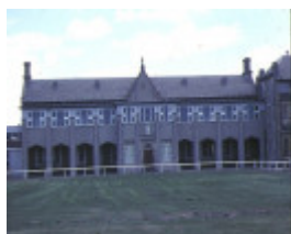
sacred heart convent & college retreat rd newtown rear building