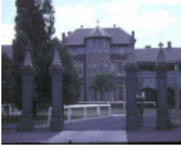
1 sacred heart convent & college retreat rd newtown front view