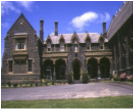
sacred heart convent & college retreat rd newtown entrance