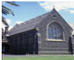
sacred heart convent & college retreat rd newtown chapel front