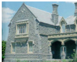
sacred heart convent & college reatreat road newtown front elevation publication