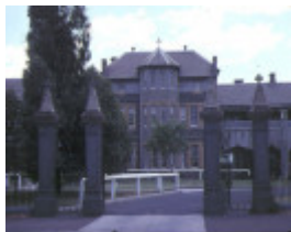
1 sacred heart convent & college retreat rd newtown front view