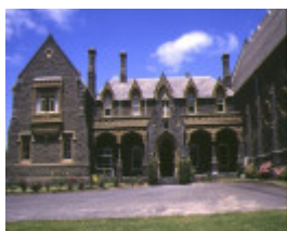
sacred heart convent & college retreat rd newtown entrance