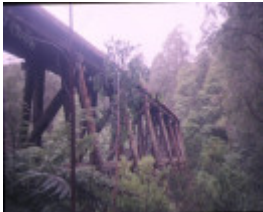
rail bridge noojee side elevation