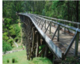
RAIL BRIDGE SOHE 2008