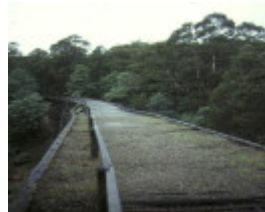
rail bridge noojee top view may1990