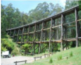
RAIL BRIDGE SOHE 2008