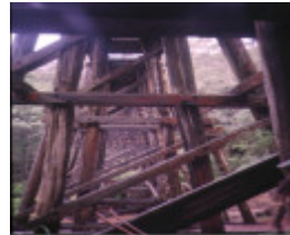
rail bridge noojee trestle view