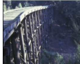
1 rail bridge noojee side view aug1982