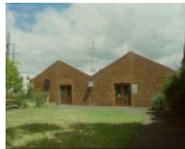
former metropolitan meat market garage