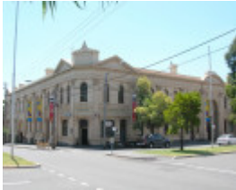
FORMER METROPOLITAN MEAT MARKET SOHE 2008