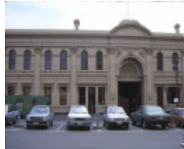
former metropolitan meat market nth melb external entrance