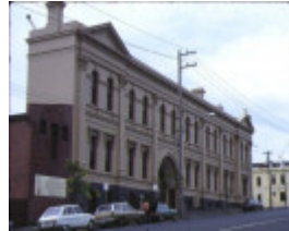
1 former metropolitan meat market nth melb external side