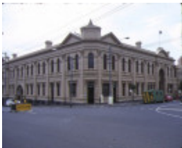
former metropolitan meat market nth melb front view