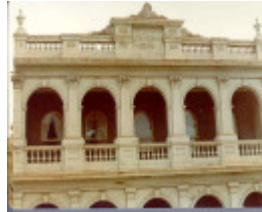
brassey house chapman street north melb balcony detail