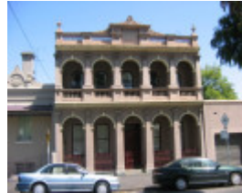
Brassey House Chapman Street North Melbourne March 2006