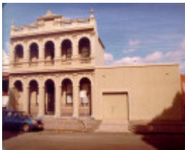
brassey house chapman street north melb front view