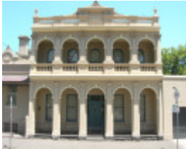
BRASSEY HOUSE SOHE 2008