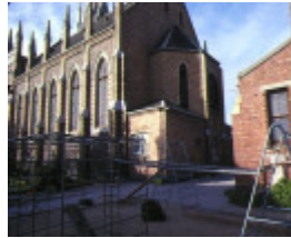
presbyterian church north melb exterior side