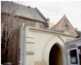
presbyterian union memorial church north melb church hall rear sw aug1999