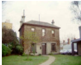
presbyterian union memorial church north melb manse sw aug1999