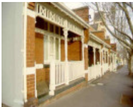
presbyterian union memorial church north melb queensberry street cottages sw aug1999