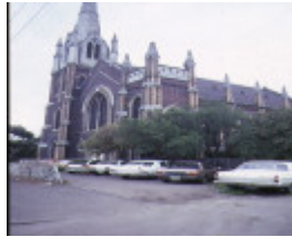
presbyterian church north melb exterior front