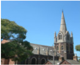
PRESBYTERIAN UNION MEMORIAL CHURCH COMPLEX SOHE 2008