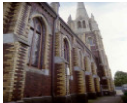
presbyterian union memorial church north melb south detail sw aug1999