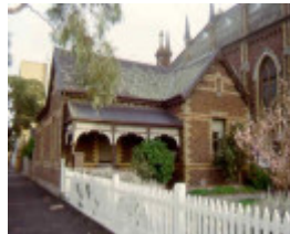
presbyterian union memorial church north melb parsonage sw aug1999