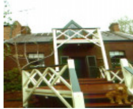
596 queensbury street rear august 2000