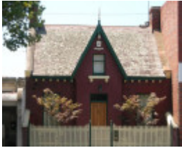
RESIDENCE SOHE 2008