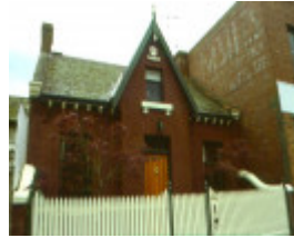
596 queensbury street august 2000