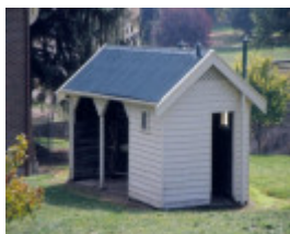
h01536 omeo justice precinct day avenue omeo magistrates stable