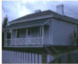
log lock up & hut omeo police station