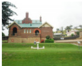
OMEO JUSTICE PRECINCT SOHE 2008