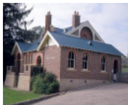
h01536 omeo justice precinct day avenue omeo 1893 courthouse western side