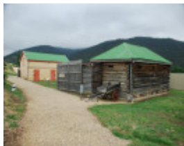
OMEO JUSTICE PRECINCT SOHE 2008