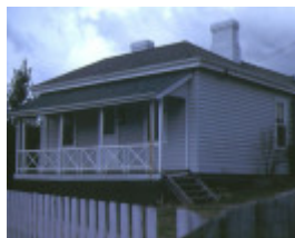
log lock up & hut omeo police station