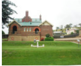
OMEO JUSTICE PRECINCT SOHE 2008