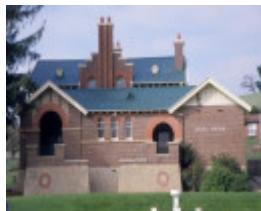
h01536 1 omeo justice precinct day avenue omeo 1893 courthouse from day avenue