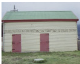
log lock up & hut omeo police stables