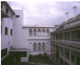
mount royal geriatric hospital poplar road parkville wing jul1998