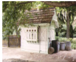
mount royal geriatric hospital poplar road parkville gate house jan1998