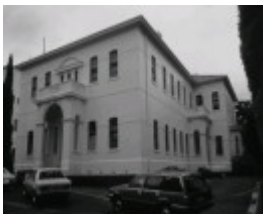
mount royal geriatric hospital poplar road parkville b&w entry extension