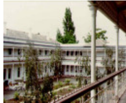
1 mount royal geriatric hospital poplar road parkville courtyard jul1998