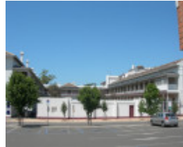
NORTH WEST HOSPITAL, PARKVILLE CAMPUS SOHE 2008