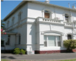
NORTH WEST HOSPITAL, PARKVILLE CAMPUS SOHE 2008