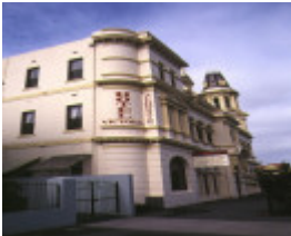
hotel victoria beaconsfield parade albert park side elevation