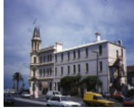
hotel victoria beaconsfield parade albert park side view