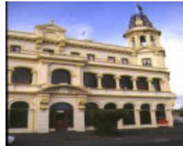
1 hotel victoria beaconsfield parade albert park front elevation