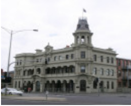
HOTEL VICTORIA SOHE 2008