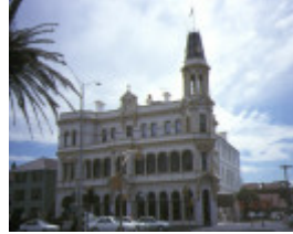
hotel victoria beaconsfield parade albert park front view