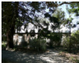
FORMER TRAVELLERS REST INN SOHE 2008