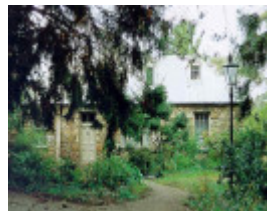
former travellers rest inn batesford front elevation publication