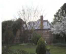
former travellers rest inn batesford side view oct1985