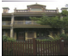
deloraine terrace royal parade parkville exterior entrance