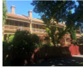
Deloraine Tce 3