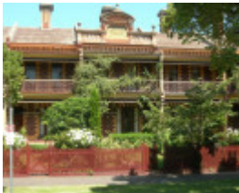
DELORAINE TERRACE SOHE 2008