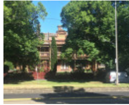
Deloraine Tce 1