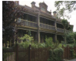
1 deloraine terrace royal parade parkville external front view