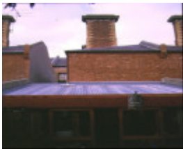
deloraine terrace royal parade parkville rear view