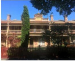
Deloraine Tce 2